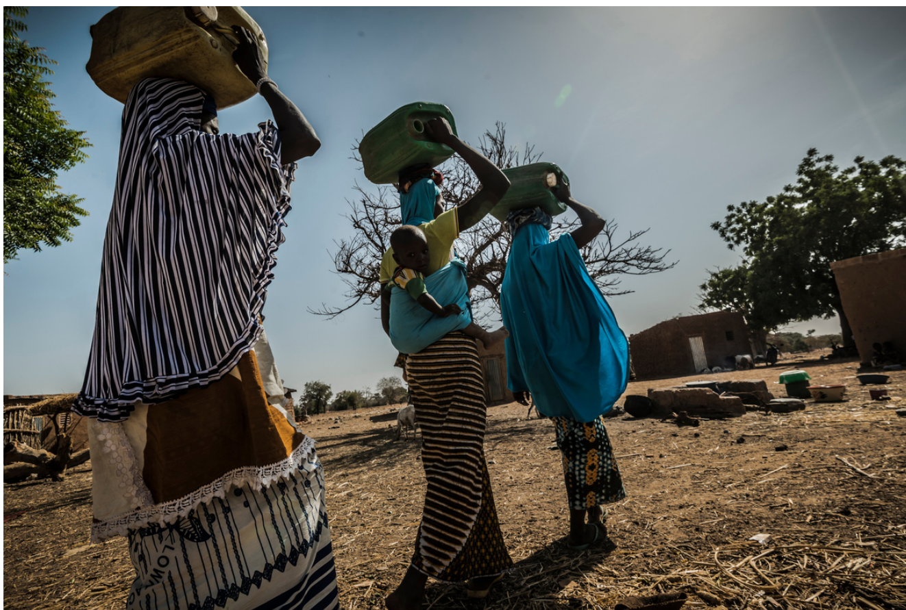
Displace women carry water cans in the Village of Sera, Burkina Faso.