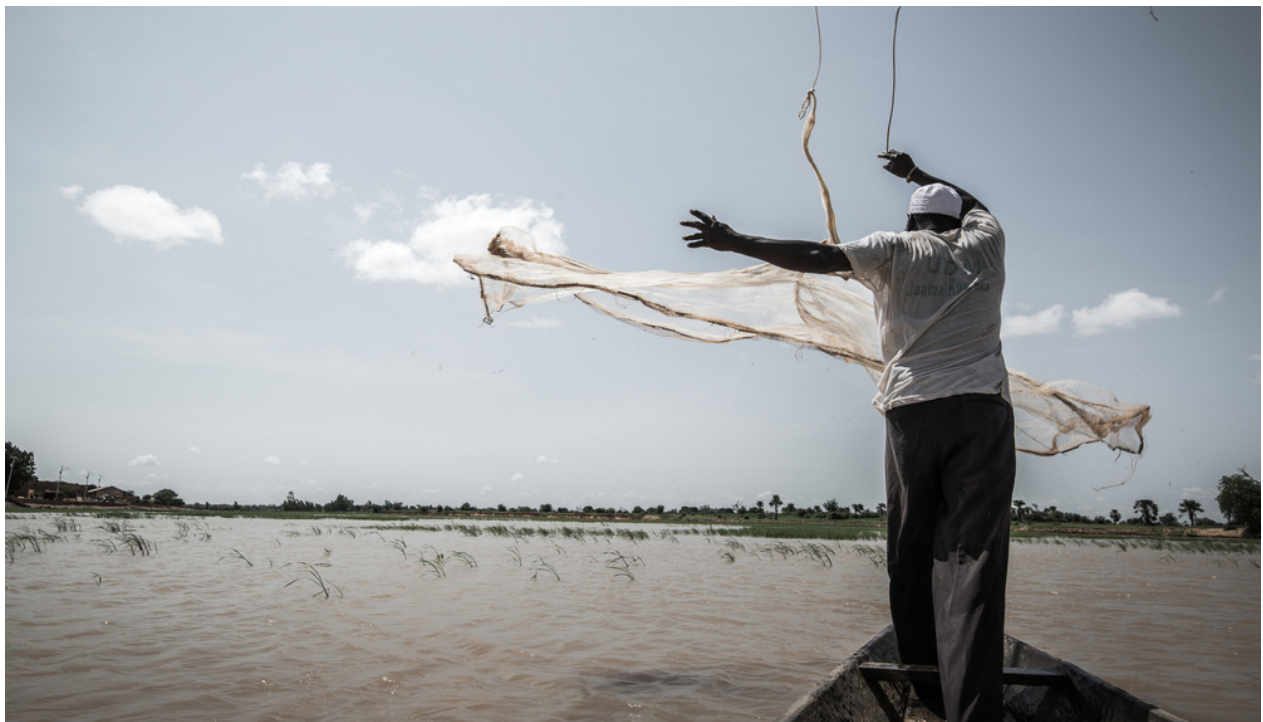
Fisherman on Yamé river in Sofara, Mali