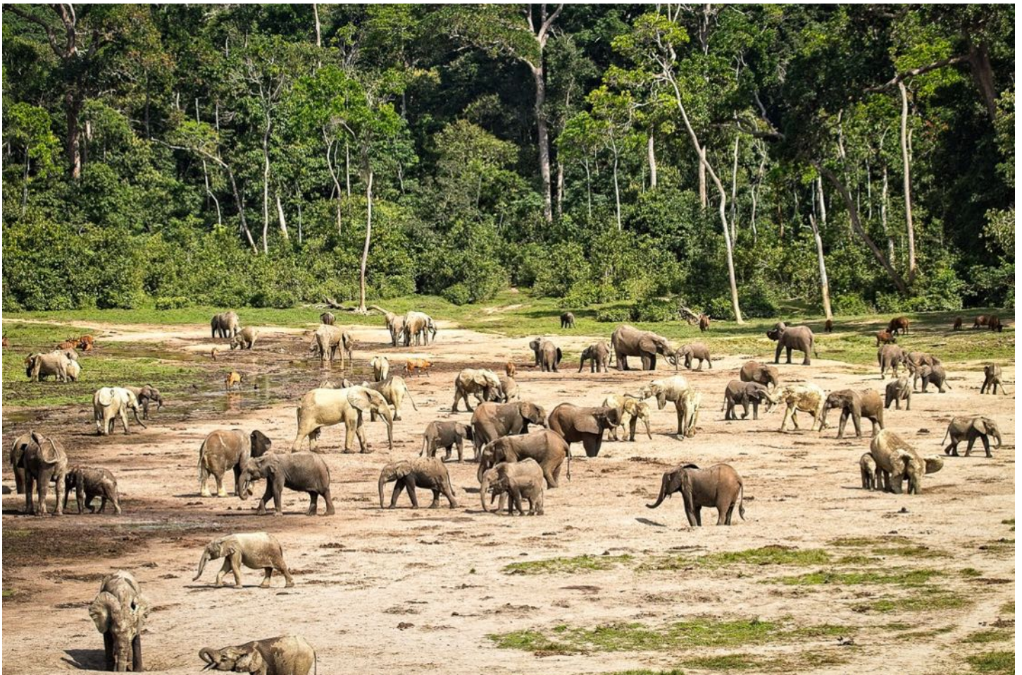
Dzanga Bai at its best

While the human world is in chaos, the Park is in excellent health. The three habituated gorilla groups continue to be followed at a safe distance and each time we visited Dzanga Bai, we were able to count at least 100 elephants.