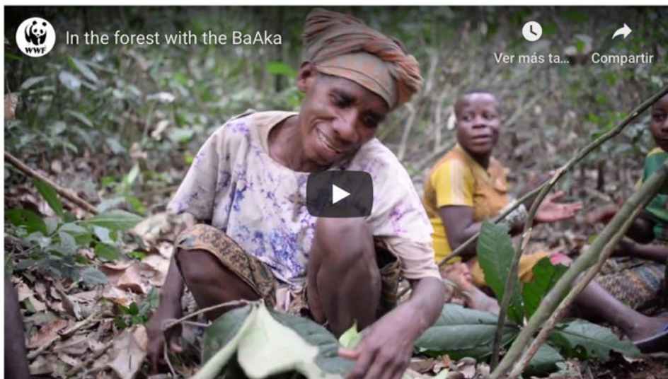
An afternoon in the forest with the youth of Ndima Kali: They try to hunt small mammals under the guidance of their doyenne and symbolically bury the bad luck when they don't catch anything. They later gather medicinal plants and build a hut in the forest.

https://medium.com/@WWF/in-car-the-baaka-community-re-turns-to-their-traditional-forests-to-avoid-covid-19-46a56a708b4b