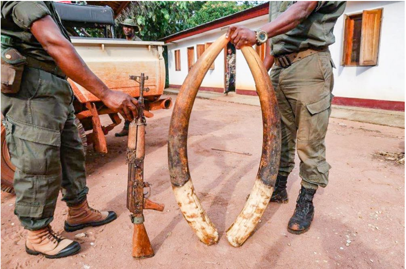
One less elephant in Africa. The only real way to stop this, is to stop the ivory demand

With great help from the population this time, rangers were able to arrest two elephant poachers who had just killed an elephant. The tusks and the weapon used were retrieved. It was an automatic weapon, an AK 47. These poachers based in Salo had already been arrested and handed to the authorities for the same reason last year. Following a hearing, one of them had been released due to doubts about his implication while the other had been sentenced to three years in prison and didn't finish serving his term yet.