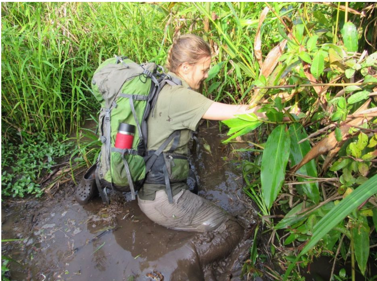
It is not always easy to respect the transects