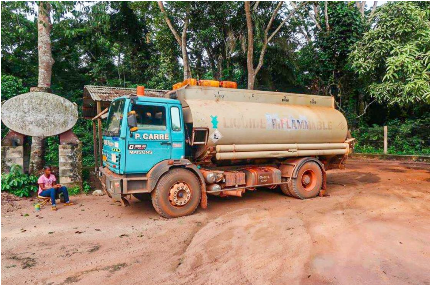
Eighteen days to cover 500 kilometers gives us an idea about the problems with the transport system in CAR

This month we received a truck with fuel. This is normally not news to highlight but this time it has been for two reasons: Firstly, with so much uncertainty about the future, this fuel stock could serve us almost until year-end. Secondly, considering that the truck left Bangui on May 30 and arrived in Bayanga on June 17, it has possibly set a new record for that distance