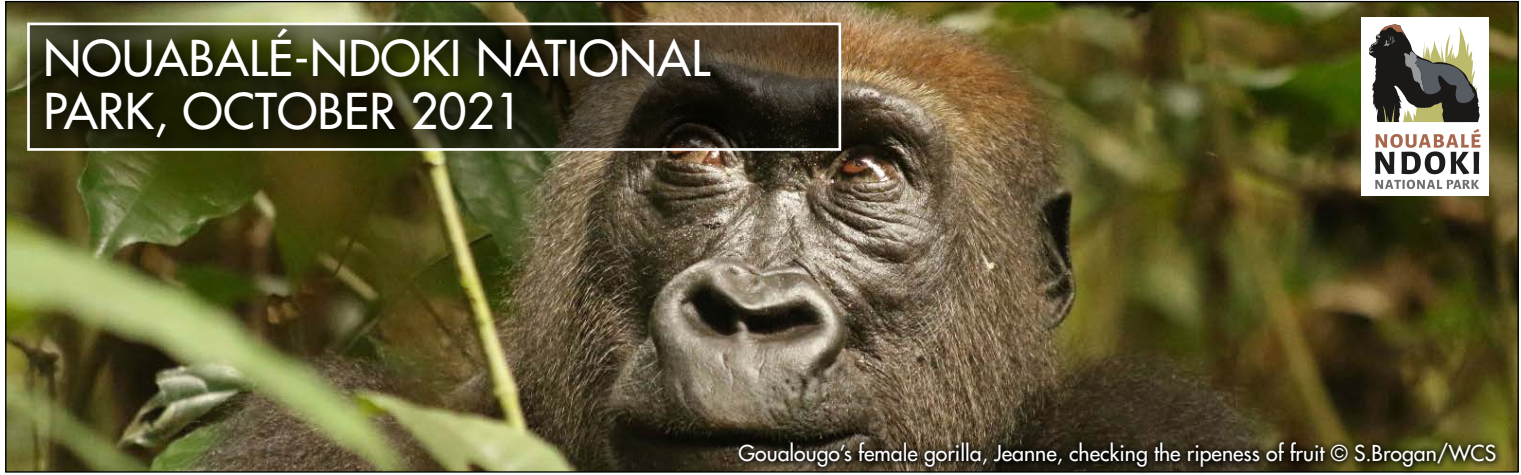
Goulougo's female gorilla, Jeanne, checking the ripeness of fruit