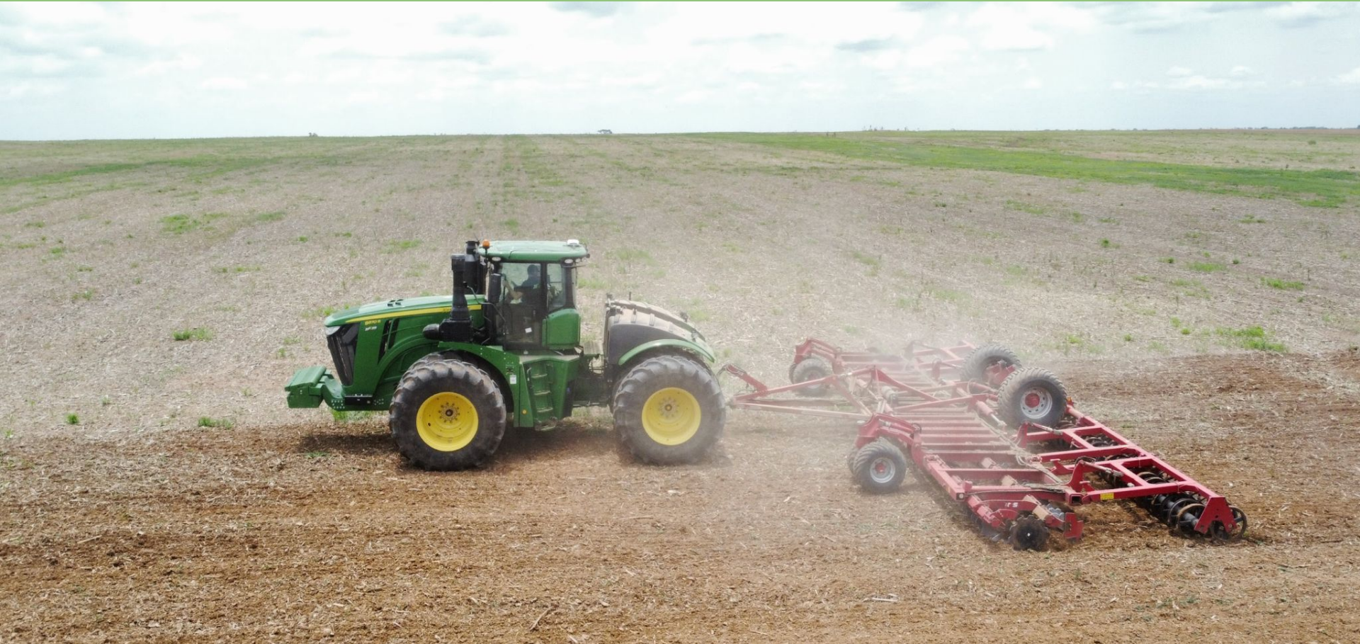
GoCongo uses GPS guided, large-scale, and modern agricultural equipment