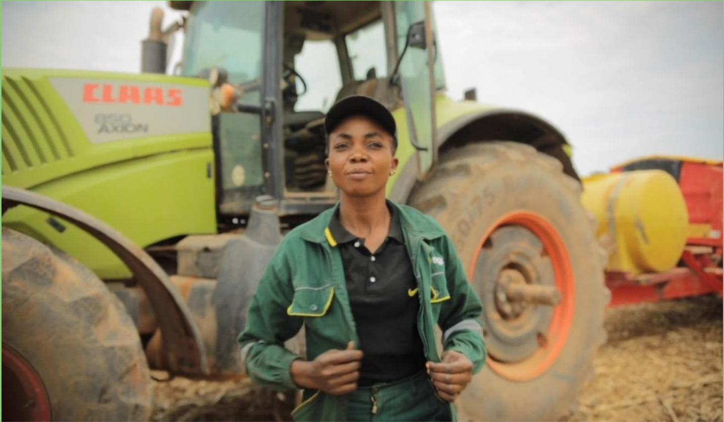
The first graduate from our professional training program: a female operator of a high tech tractor