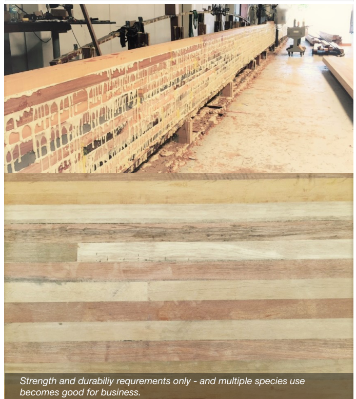
Strength and durability requirements only - and multiple species use becomes good for business.